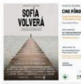
Cartel de la película «Sofía volverá»

«Sofía tiene 12 años cuando en octubre 2019 la mortandad de peces en el Mar Menor le cambia la vida para siempre. Su padre, un pescador afectado por la parada pesquera, decide vender su barco e iniciar una nueva vida en Canadá. Sofía se convierte en la primera refugiada por causa medioambiental del Mar Menor. Volverá en el año 2056». Así presentan al personaje de esta historia producida por Indirectfilm íntegramente con actores murcianos, desde niños y pescadores a los compositores de la música del film.